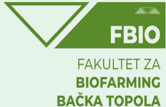
Faculty of Biofarming Bačka Topla