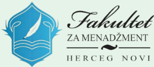
Faculty of Management Herceg Novi