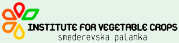
Institute for Vegetable Crops Smederevska Palanka