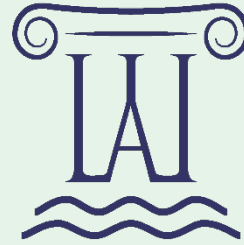
АКАДЕМИЈА СТРУКОВНИХ СТУДИЈА ШАБАЦ